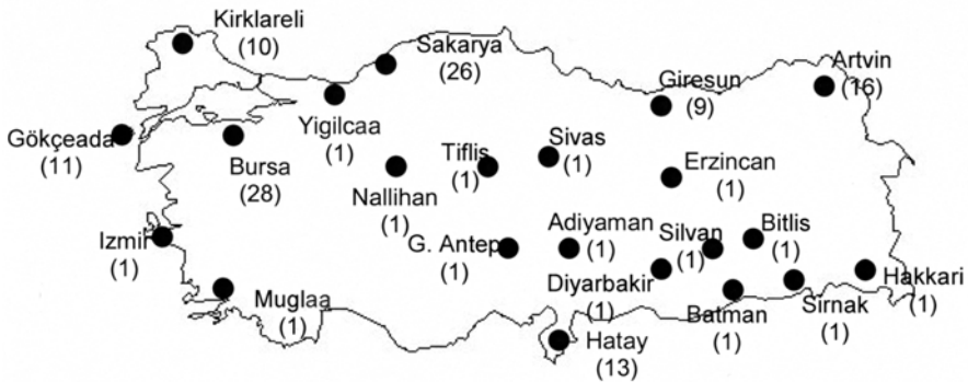
Fig. 1. Sampling locations in seven geographical regions of Turkey for Apis mellifera "C" lineage, and A. m. syriaca and the number of colonies (n) from each sample location.

DNA sequences were aligned with CLUSTAL W (Thompson et al. 1994) using Bioedit v5.0.7 (Hall 1999). Number of mitotypes and their frequencies were determined both visually and with the program DNAsp version